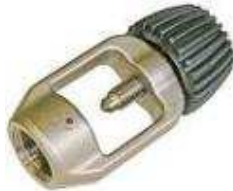
International filling connector