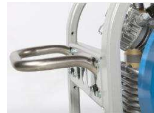
Crash frame incl. handles

The corrosion-resistant crash frame provides additional protection for the unit and can accommodate additional accessories such as a compressor control or a larger filter system. The handles make moving the unit easy and convenient.