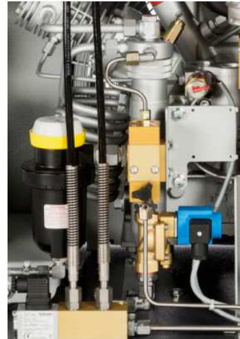
Automatic condensate drain system

For petrol version, the automatic condensate drain system is supplied without control!