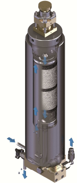
Purification System P21/350