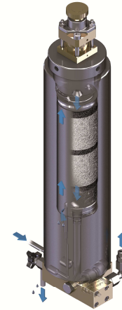
Purification System P31/350 (illustration similar)