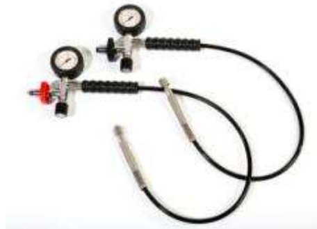
Filling device PN200 (black) and PN300 (red)