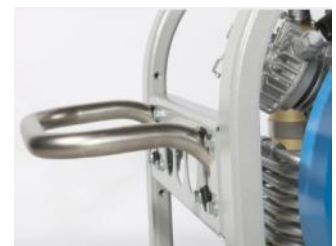
Crash frame incl. handles

The corrosion-resistant crash frame provides additional protection for the unit and can accommodate additional accessories such as a compressor control or a larger filter system. The handles make moving the unit easy and convenient.