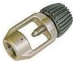
International filling connector