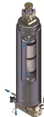
Purification System P21/350