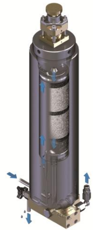
Purification System P31/350 (illustration similar)