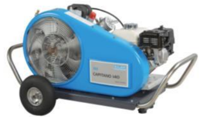
CAPITANO-B with trolley

The trolley provides an easy and convenient mode of transport for mobile compressor units. Fitted with pneumatic tyres, the trolley maximises mobility. Complete with 1 axle, 2 wheels and towbar mounted on the compressor frame.