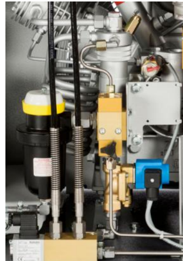
Automatic condensate drain system

For petrol version, the automatic condensate drain system is supplied without control!