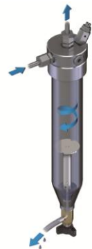
Intermediate separator after 1st stage

In the case of operation in locations where air humidity is high (tropical regions, for example), we recommend installing a separator downstream of the first compressor stage. This can extend the service life of the unit and reduce maintenance costs.