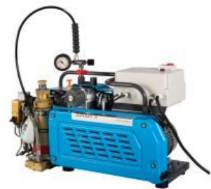
JUNIORII-E with automatic condensate drain system and control box