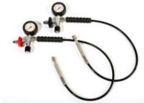
Filling hose PN200 (black) and PN300 (red)