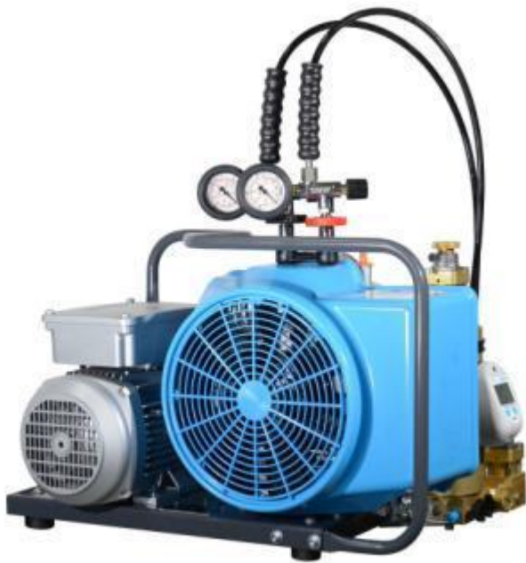
JUNIORII-W (including accessories)