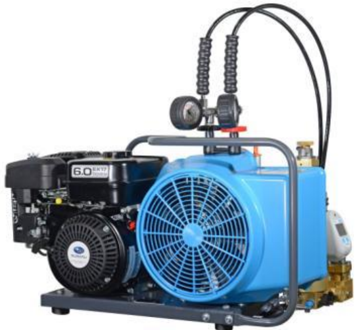
JUNIORII-B (including accessories)