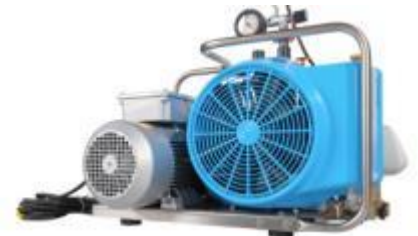
JUNIORII-W with stainless steel frame

Primary and supporting frame in stainless steel version are available as an option.