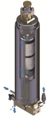
Purification System P21/350