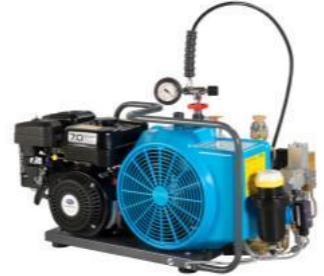
JUNIORII-B with automatic condensate drain system