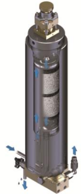
Purification System P21/350